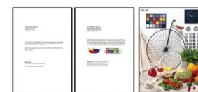
#1 Black text #2 Colour #3 Photo 4R

*1 Print speed (Pages Per Minute) is calculated when printed on A4 plain paper in the fastest mode, 10 x 15 cm photo print speed when printed on Epson Premium Glossy Photo Paper. Print speed may vary depending on system configuration, print mode, document complexity, software, type of paper used and connectivity. Print speed does not include processing time on host computer.